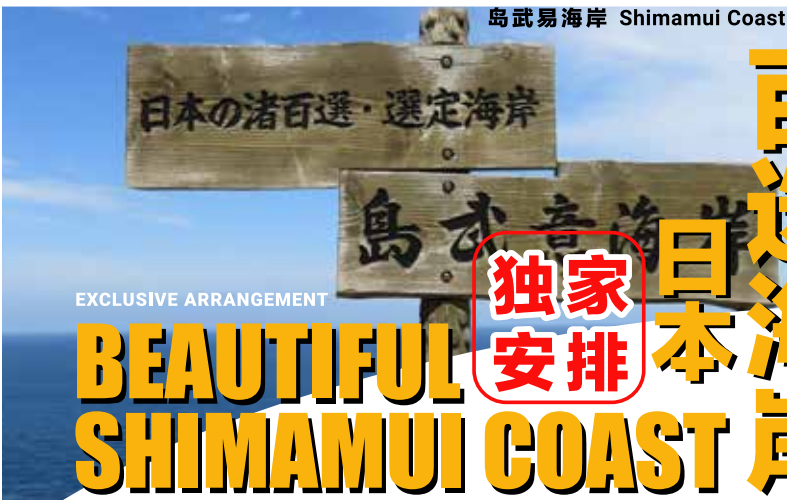
島武易海岸 Shimamui Coast