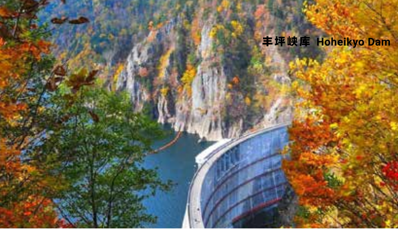
丰坪峡库 Hoheikyo Dam