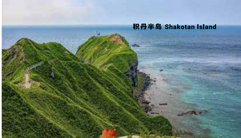
积丹半島 Shakotan Island